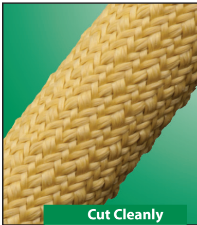
Cut Cleanly Flexo Aramid Shears